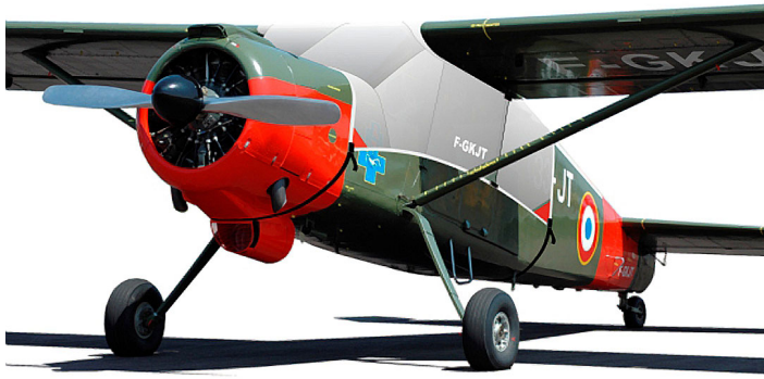
Broussard Canopy Cover (illustration)