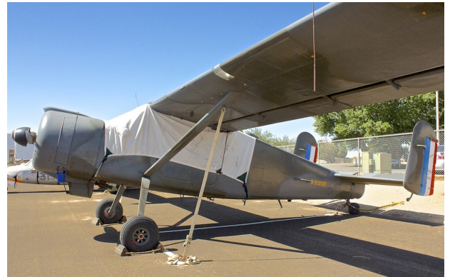
Broussard Canopy Cover