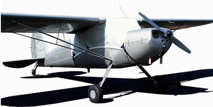
Cessna 120 Over-Top Canopy Cover

This cover type is made from Silver Acrylic Sunbrella canvas and is 100% lined with a soft and smooth microfiber. Bruce's Custom Covers developed this material combination especially for aircraft protection. The outer material is medium weight and treated for water resistance, UV resistance and anti-static buildup. The inner lining is a very soft and smooth microfiber to prevent scratching. The material is very reflective, and tests show that the cabin interior temperature can be reduced to near-ambient temperature on the hottest of days. It is water, ice and snow repellent, yet breathable to allow moisture to escape from between the cover and the aircraft surface.