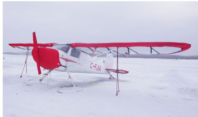
Cessna 120 Insulated Engine & Prop Covers, Wing & Tail Covers