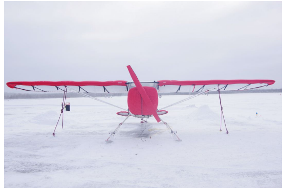
Cessna 120 Insulated Engine & Prop Covers, Wing & Tail Covers