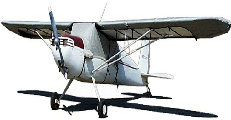
Cessna 120 Canopy Cover & Wing Covers