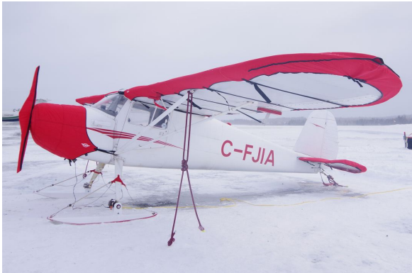
Cessna 120 Insulated Engine & Prop Covers, Wing & Tail Covers

WINTER USE MATERIAL - Made with Solution-Dyed Polyester fabric, this option is intended for seasonal use to aid in deicing, rain mitigation, or for occasional travel. The material is lighter and more compact, but more susceptible to UV damage and may have a shorter useful life if used continuously outside than the all-year use material.