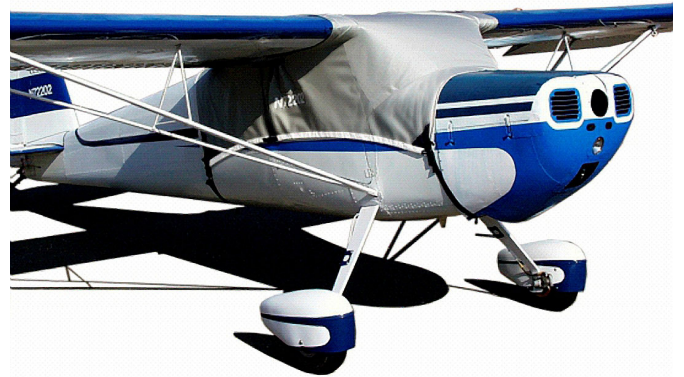
Cessna 120 Over-Top Canopy Cover