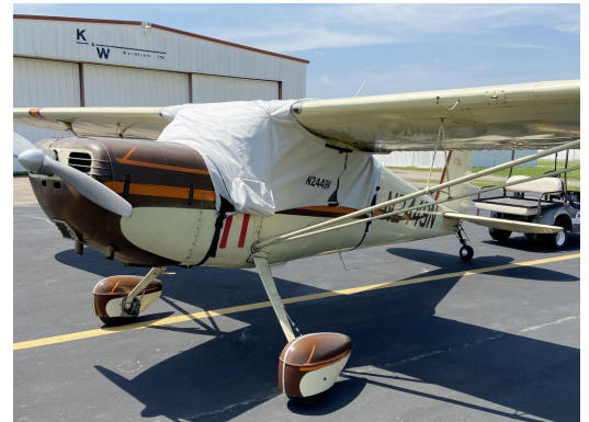
Cessna 140 Over-Top Canopy Cover