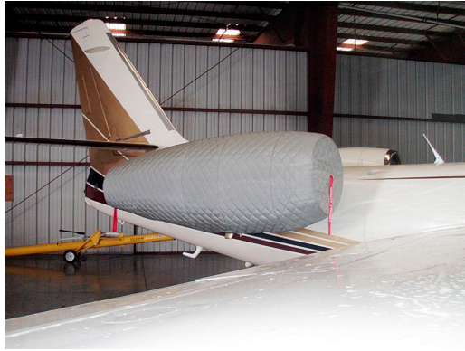
IAI Westwind Insulated Engine Nacelle Cover

instructions. The aircraft's registration number can be silkscreened onto the cover for an extra charge.