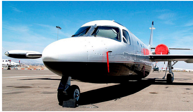
Westwind Engine Cover Set, Pitot Cover